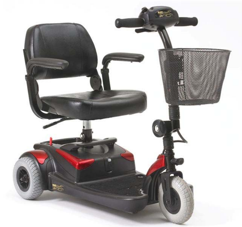
GB-106 and GB-106XR Buzzaround Lite™